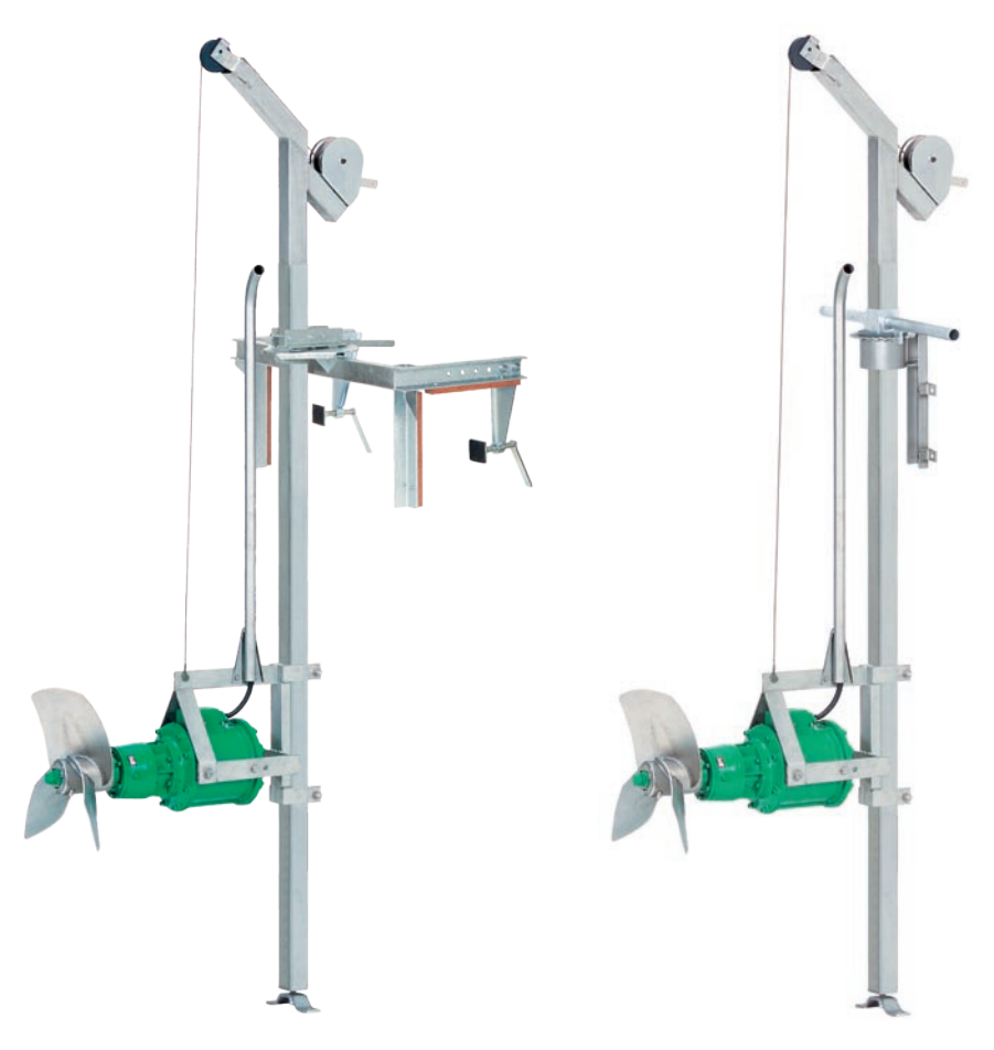
SUSPENSION FOR OPEN PITS